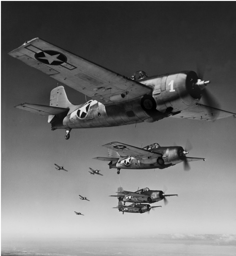
F4F Wildcats in flight.